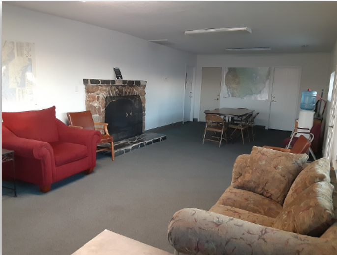
Here's a "before" picture of the inside of the pilot lounge.