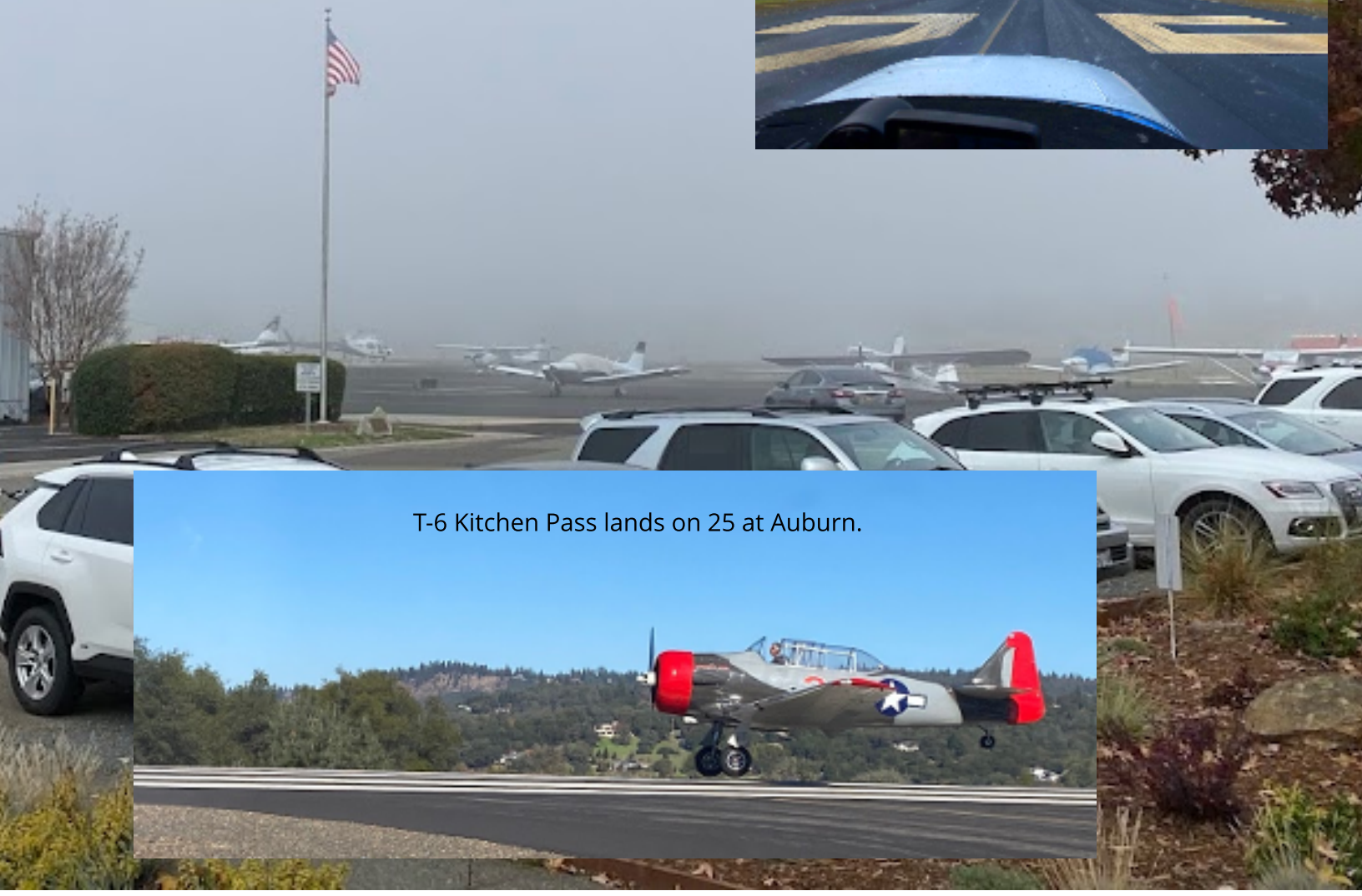
T-6 Kitchen Pass lands on 25 at Auburn.