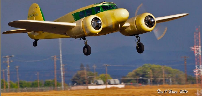
The Adventure Flights Cessna Bobcat T-50 Bamboo Bomber gave rides at our FlyDay Friday event.