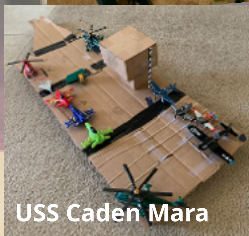
USS Caden Mara