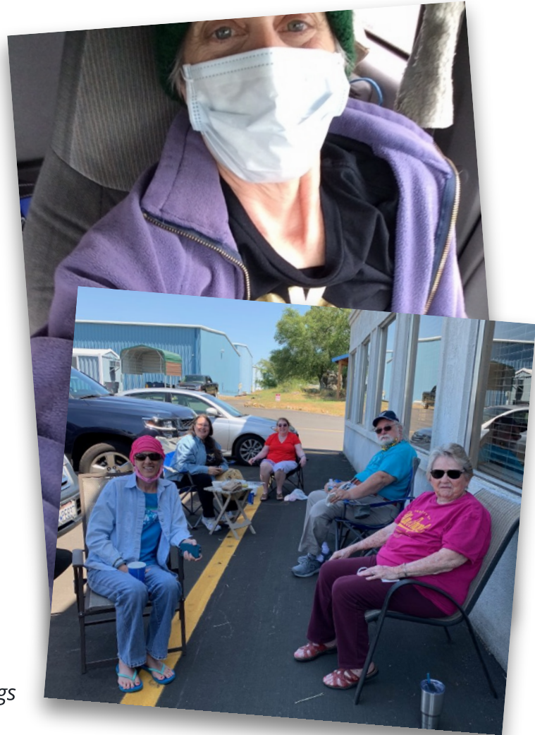
Photo: A few of us 99s who went to Alaska last year have been getting together to support Wings before they opened for dining in.