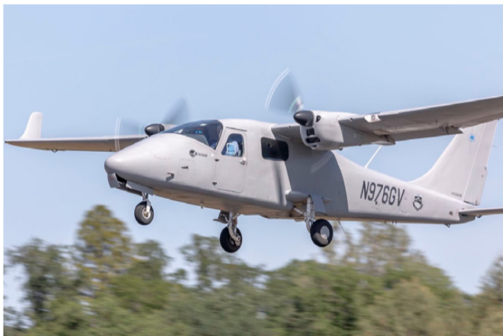
Tecnam P2006T SMP