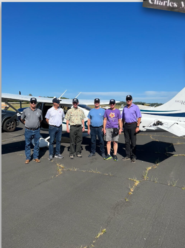
William Jessup University (WJU) Aviation Program leadership