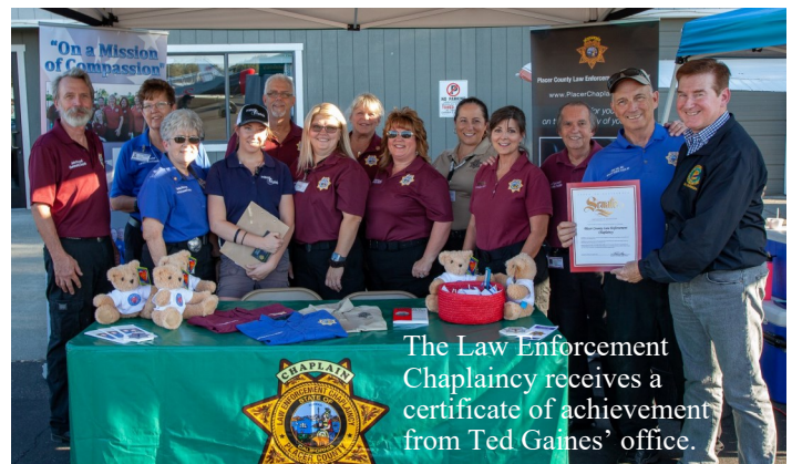
The Law Enforcement Chaplaincy receives a certificate of achievement from Ted Gaines' office.